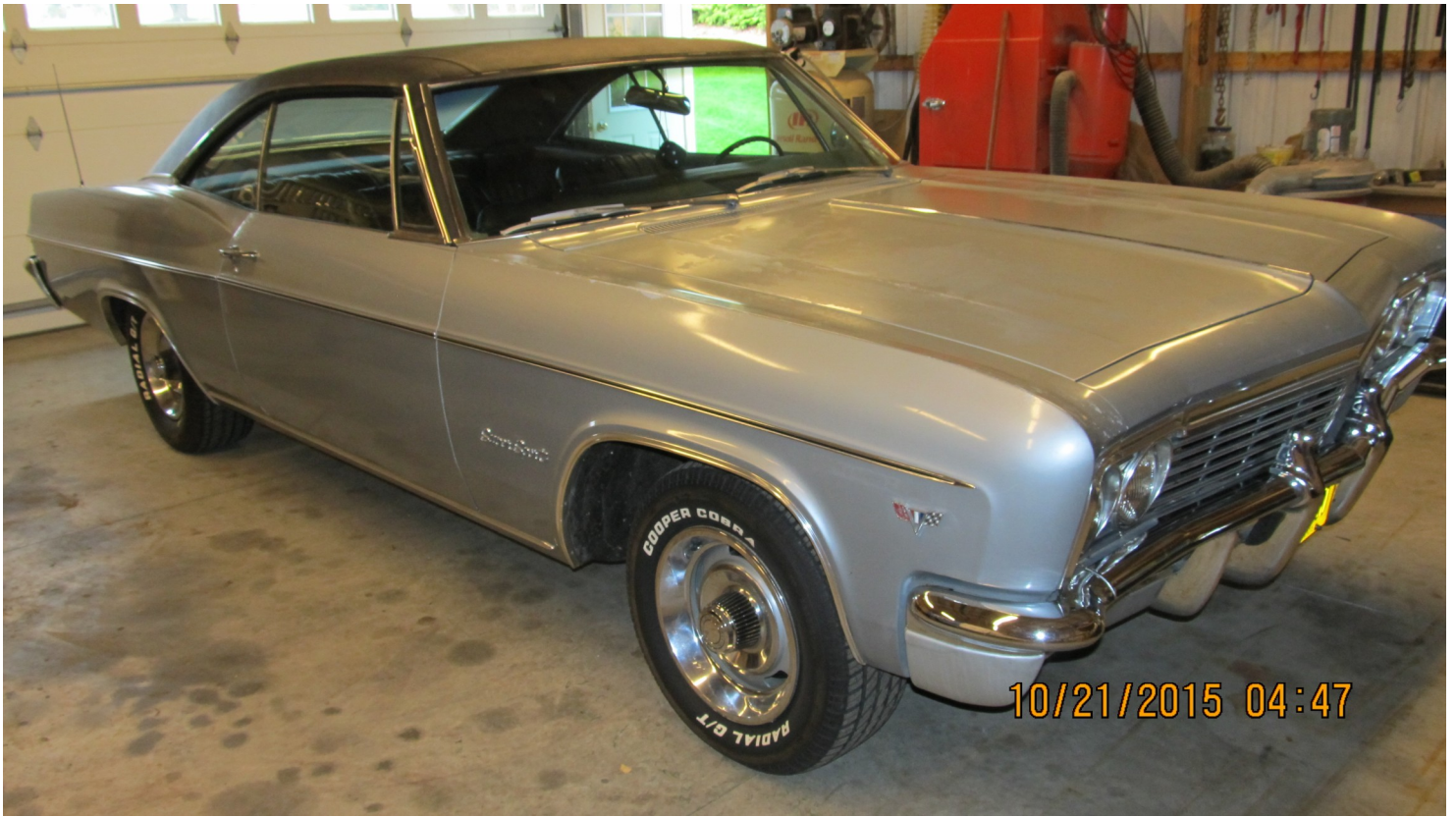
1966 Chevy Impala SS