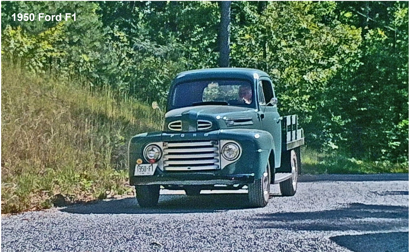
1950 Ford F1