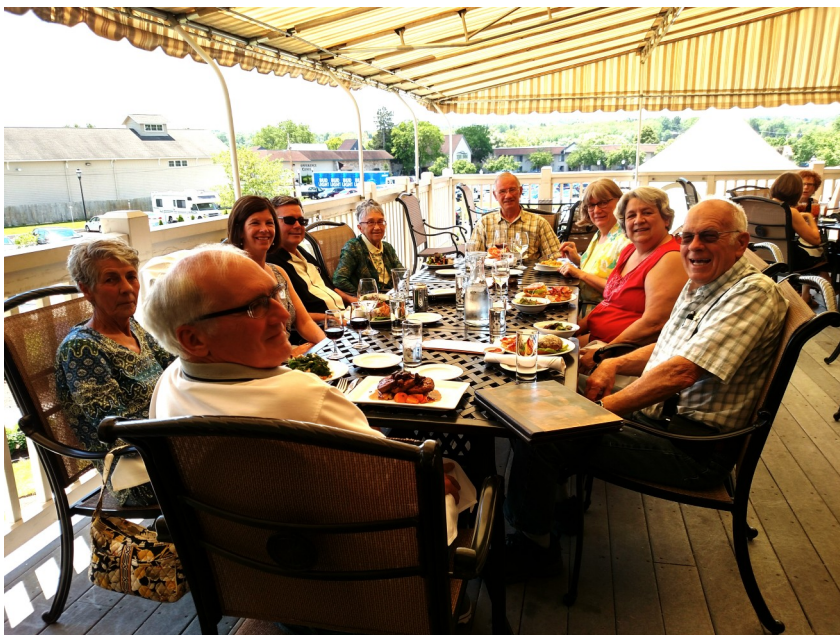
The 9 th of June was a beautiful sunny day when a group of Wayne Drumlins members met for lunch on the upper deck of the Wine and Culinary Center in Canandaigua. Good food and great company.