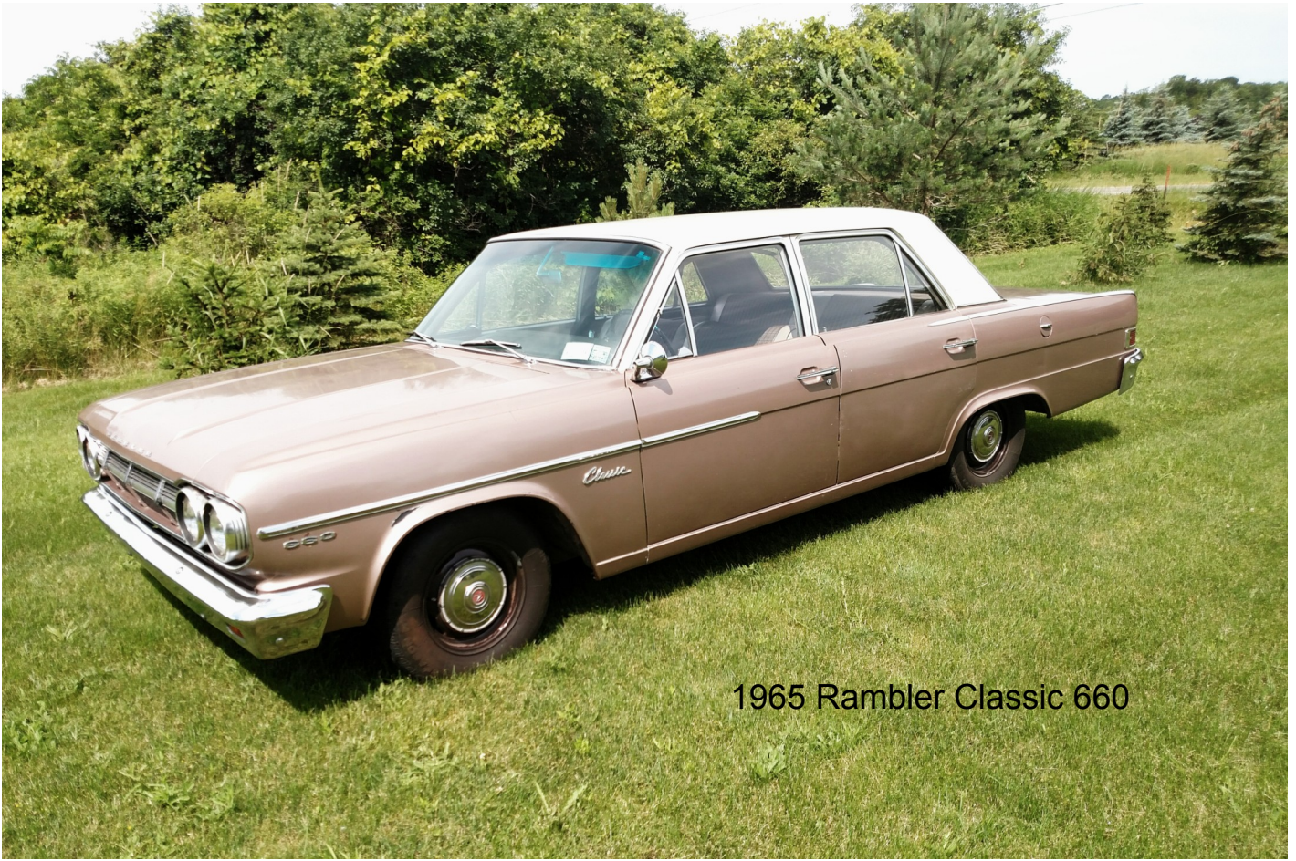
1965 Rambler Classic 660