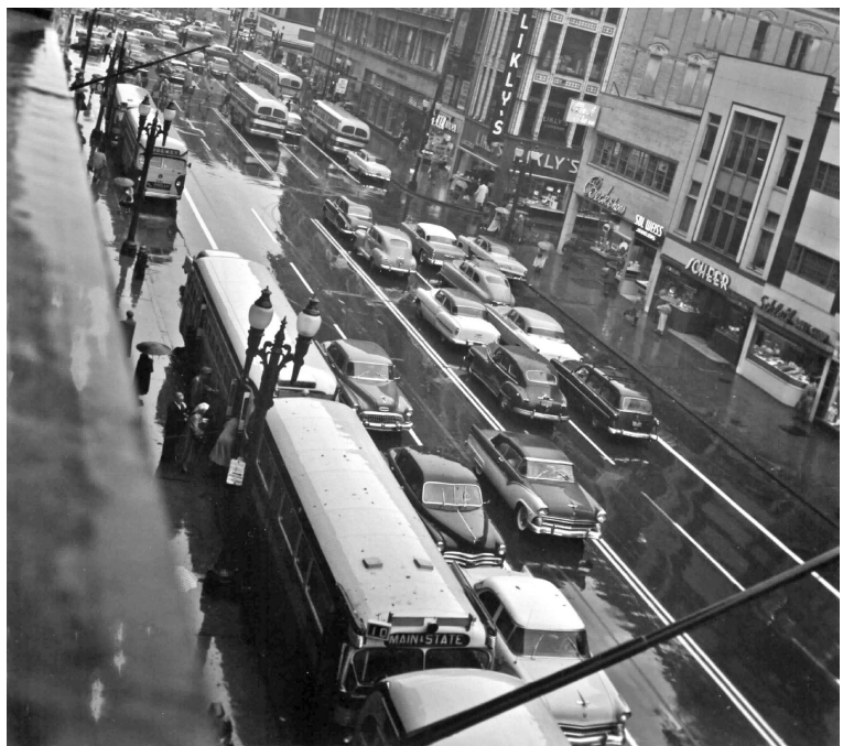
East Main Street, Rochester, looking towards East Avenue. ca 1954