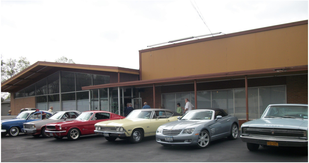
Wayne Drumlin vehicles at the first garage tour