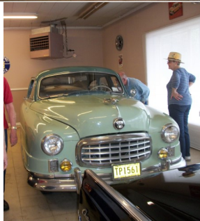
Cars from the garage tour on May 16th. We had a nice turn-out of members and cars. We stopped first at Ontario St. in Phelps for a surprise tour of these gems.