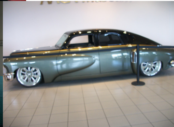
The "New Tucker 48" at the AACA Museum. We visited the museum while in Carlisle for their spring swap meet.