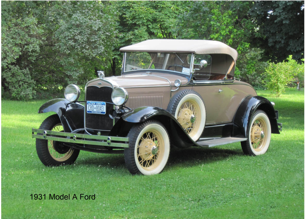
1931 Model A Ford