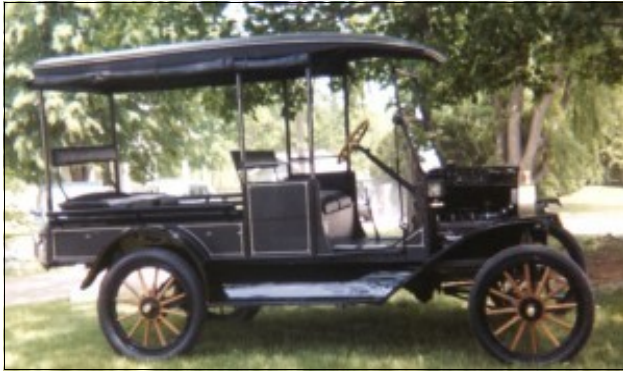
Geneva Historical Society's 1916 Model T Ford

President's Message continued from page 1