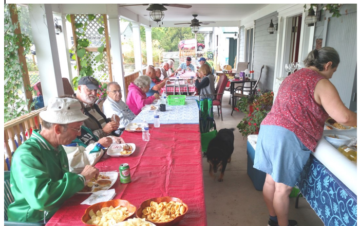
President's Porch Picnic