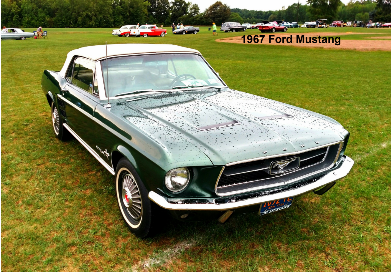
1967 Ford Mustang