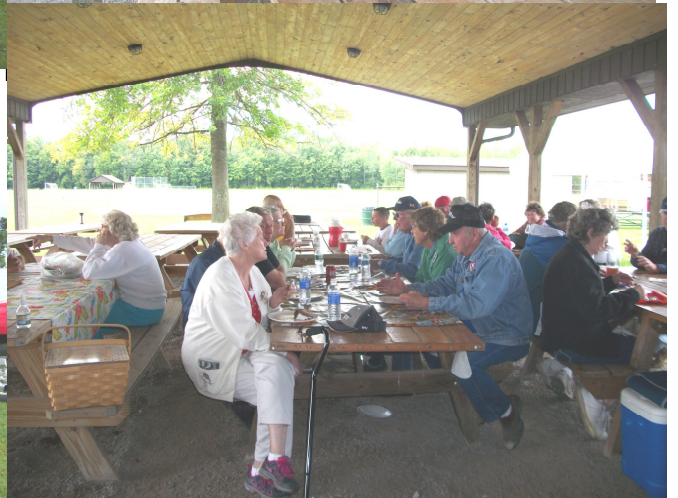
Saturday's lunch after the work was done