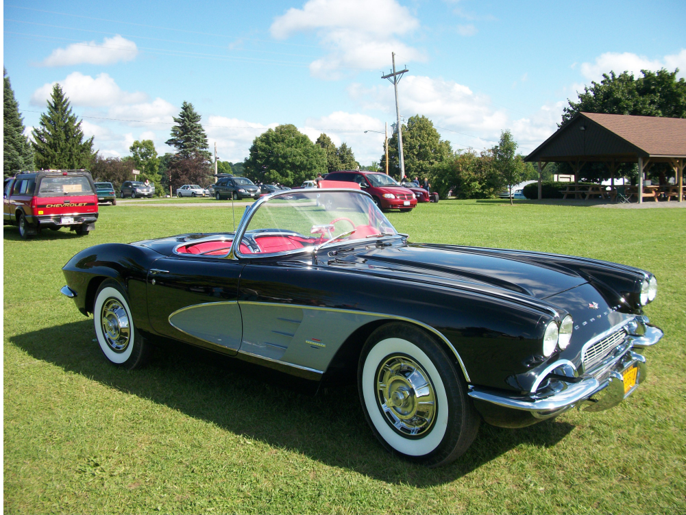
This year's Best of Show