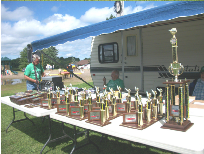
This year trophies