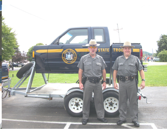
Roll over demonstration at the Show on Sunday by the NYS Troopers