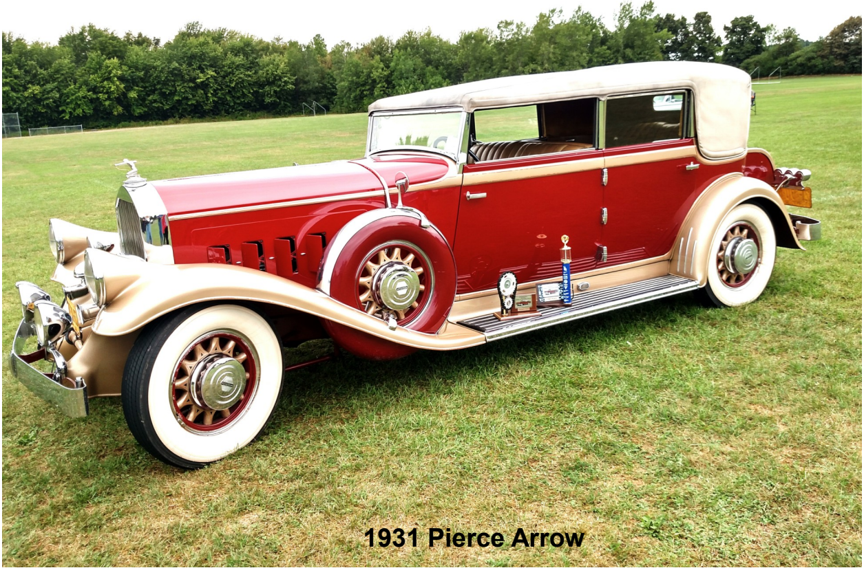
1931 Pierce Arrow