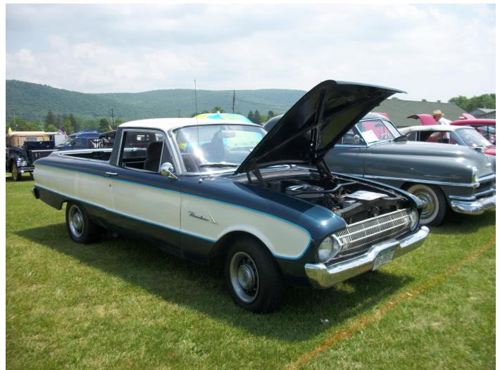
1961 Falcon Ranchero