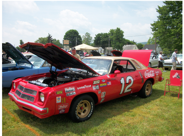
Bobby Allison 1975