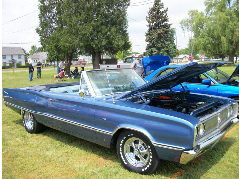
1967 Dodge Coronet