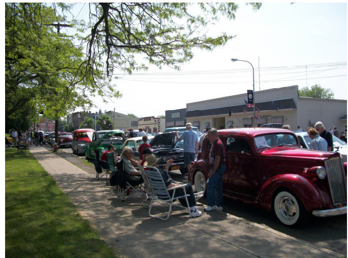
Wheels on Main Street, Waterloo, NY—2011