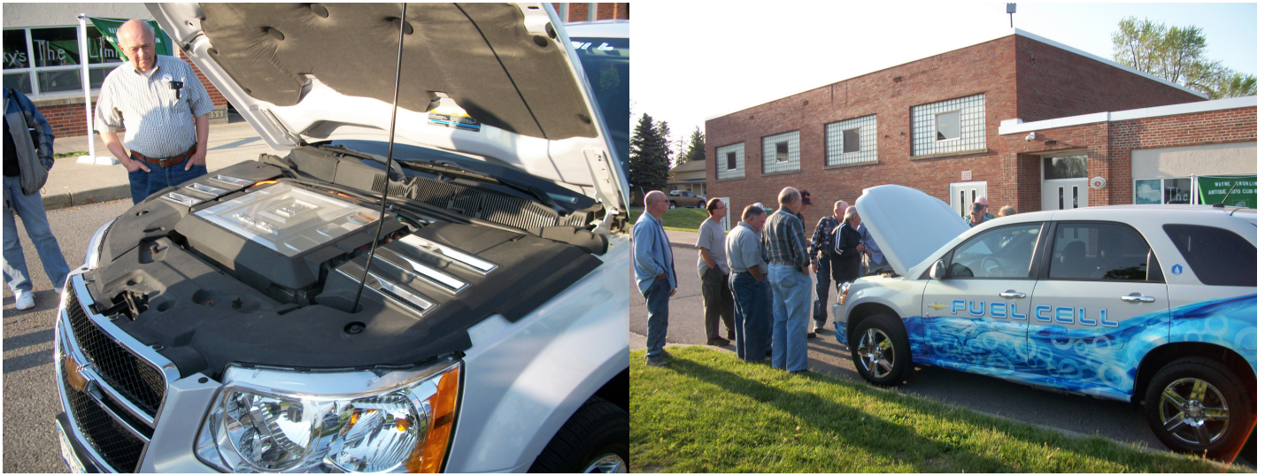
Fuel cell car at last meeting