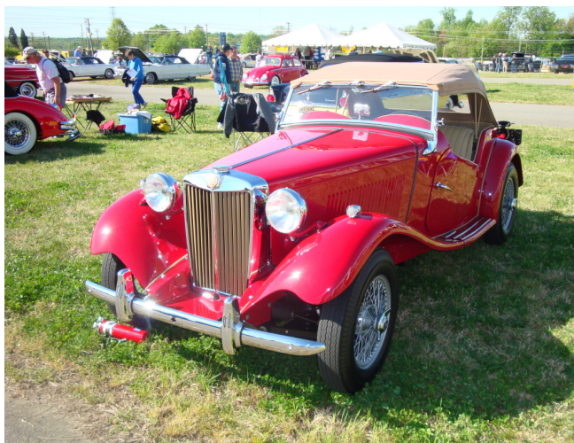
1953 MG TD