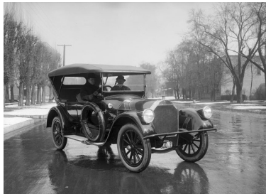
1915 Touring Car