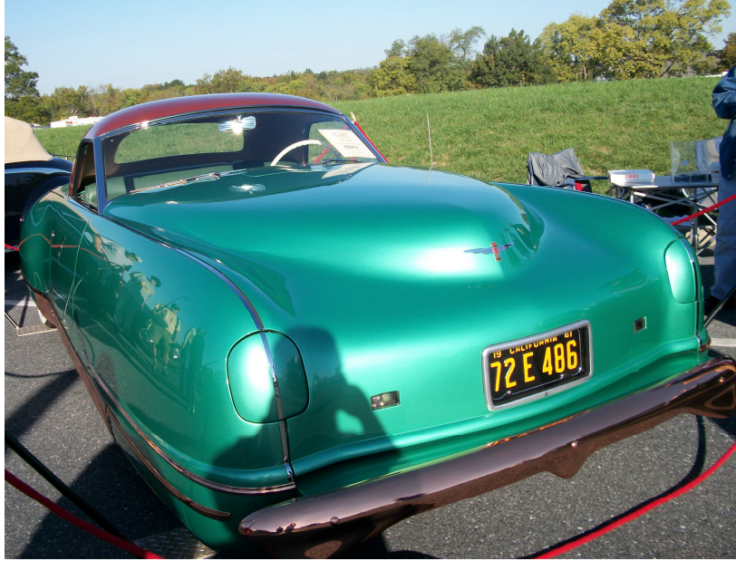
1941 Chrysler Thunderbolt seen at Hershey 2010