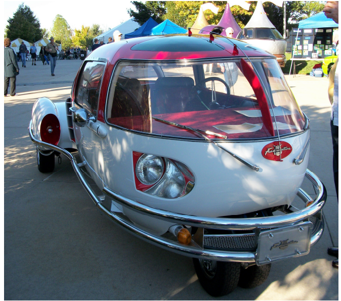
Seen at Hershey 2010