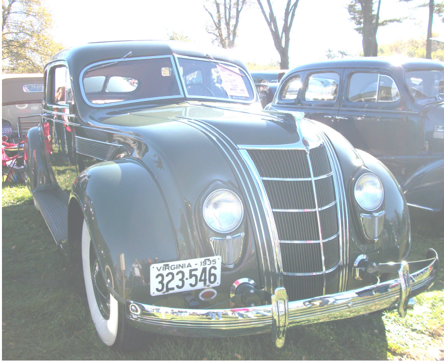
1935 Chrysler Airflow