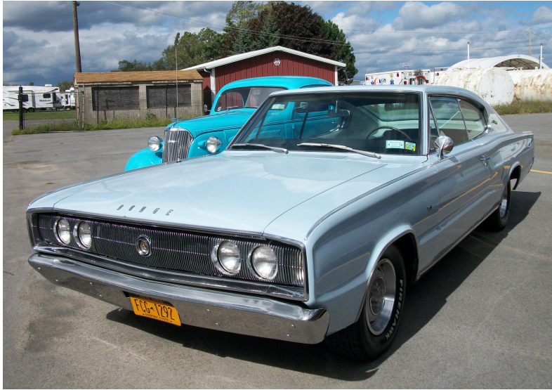
1966 Dodge Charger (newest addition to the Empson family)