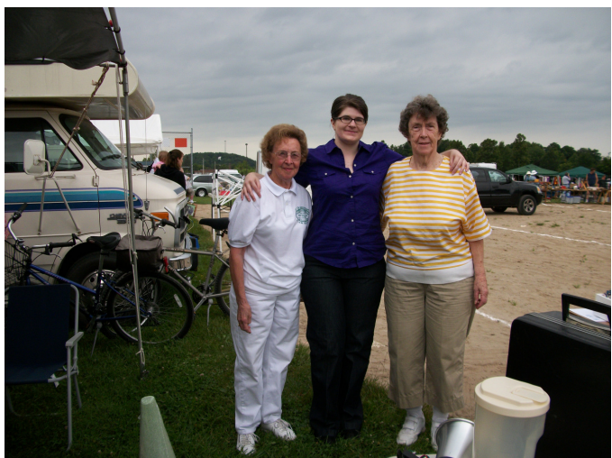
Ladies Flea Market Spot