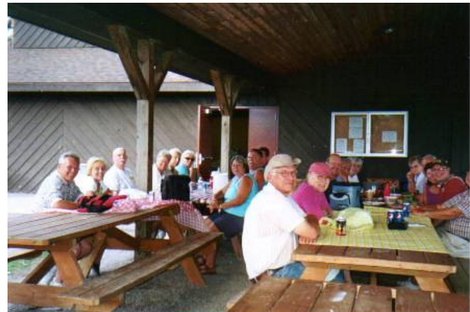
The fields are ready, the signs are out, the trophies are together and it is time to relax before the show on Sunday.