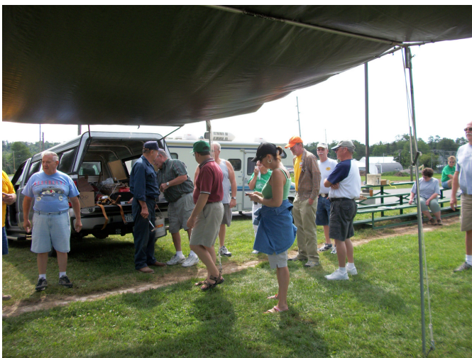
Lots of help setting up the show and flea fields for our 33rd annual car show.