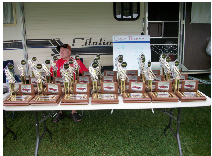
Trophy table located at Headquarters