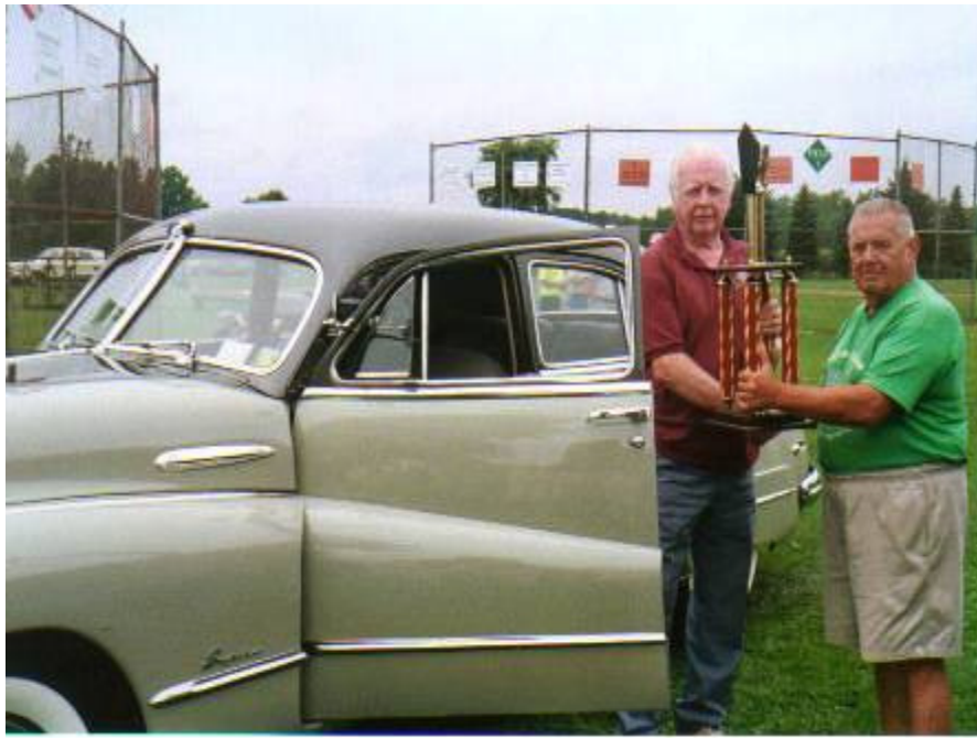
Best of Show 1948 Buick