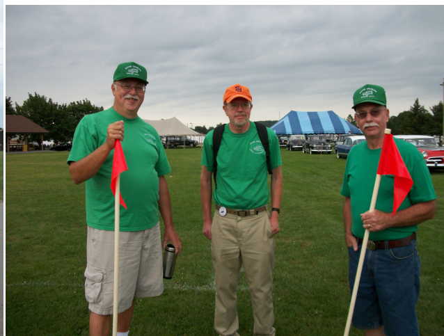
Show field workers