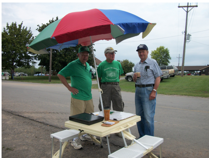
Flea Market Registration